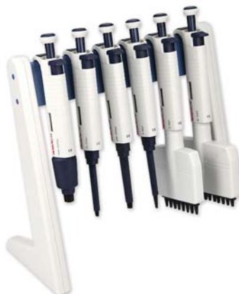
▶ Linear stand