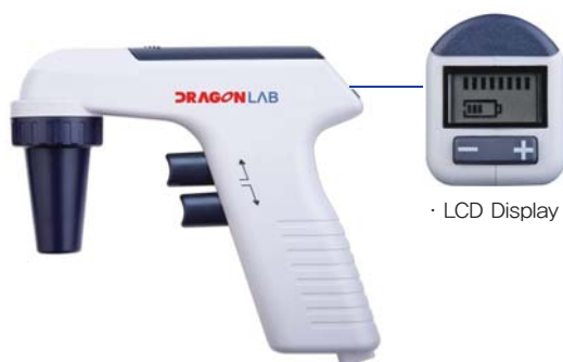
· LCD Display