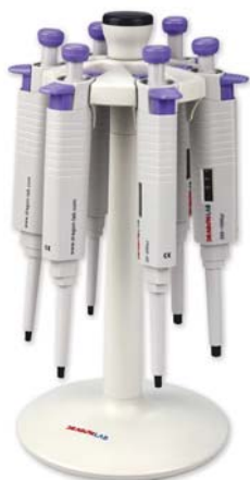
▶ Round stand